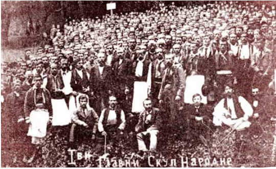
PEOPLE'S RADICAL PARTY GATHERING