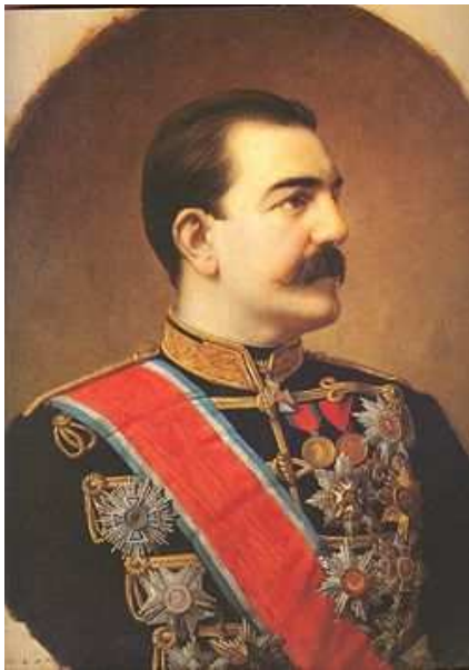
KING MILAN OBRENOVIĆ

According to Nikola Pasic, the Berlin Congress sharpened the conflict between two statehood ideas: the Serb and the Austro-Hungarian. “The idea of our people is the one of liberation, while the idea of the Austro-Hungarian state, notably since lately (i.e. since the Berlin Congress – L.P.), is the one of South-East enlargement. The two states have always been in conflict and will be in conflict in the future,” said Pasic.