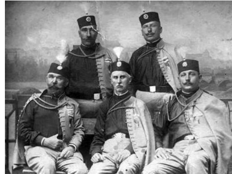
"THE BLACK ARM" LEADERS

This mere form hardly evoked Europe's sympathy. The country's international position aggravated. Because of the murder of the royal couple England broke relations with Serbia and conditioned renewal of those relations by the punishment of the plotters. It was only in 1906 that the plotters were brought before justice. However, in 1911 they set up a clandestine organization under the name "Unification or Death," or, known as "The Black Arm."