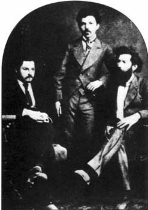
LAZA PAČU, PERA TODORVIĆ AND NIKOLA PAŠIĆ

editorial published in this issue was actually the party program. Another article informed the readership that the magazine would stand for “the policy and principles of the People’s Liberal Party.” The liberals, having been in power for long time, rejected rashness and refused to enter “the arena of demagogic agitation” while advocating gradualism . At the convention of the Society for the Development of Serb Literature on October 17, 1882, Jovan Ristic came out with the slogan “ Laboramus ” (we work). Referring to his cabinet’s attitude towards the trade agreement with Russia he considered disadvantageous for Serbia, he said, “Not only states and individuals but also parties and associations should not be indifferent when it comes to dignity.” The liberals’ policy was determined by two goals. First, “liberation and unification of the dismembered Serb provinces.” Second, “the search for larger and firmer foundations for rational and historically justified fostering of the people’s well-being and the country’s intellectual and natural resources, as well as for strengthening of the nation as a whole and securing its future.”