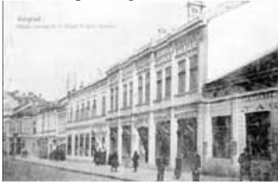
BELGRADE, END OF XIX CENTURY

channels the people's cultural life to some other destination. We must do everything in due time...A disease has to be treated before it destroys and eats up an organism..."