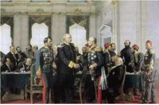
BERLIN CONGRESS, 1878

Before the newspaper appeared, actually in 1880, a group of elected representatives in the People's Assembly formed a parliamentary caucus and called renamed themselves from socialists to radicals. What prompted them to form the caucus was the Assembly's "address" to the ruler. The "address" usually contained a government's program. This time it was about the "address" the new "early-conservative," i.e. progressive cabinet of Milan Pirocanac submitted to Prince Milan. Oppositionists voted down the "address" due to the change in Serbia's foreign policy: distancing from Russia and moving towards Austro-Hungary.