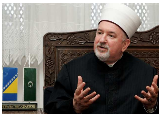
Reis-ul-Ulema Mustafa Ceric

The developments preceding the reconciliation between the two leaders laid bare the problems plaguing Sandzak. The authorities banned a meeting in Tutin where Reis-ul-Ulema of Bosnia-Herzegovina Mustafa Ceric was supposed to address citizens and believers during his visit to Sandzak, whereas the Ministry of Religions and the Islamic Religious Community in Serbia exchanged strong accusations.