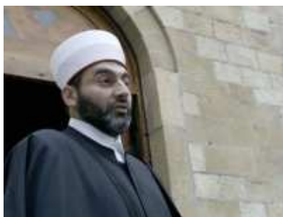
Belgrade Mufti Muhamed Jusufspahic

Many interpreted the establishment of the political council as a proof of Mufti's political ambitions and adding fuel to the fire. Belgrade Mufti Muhamed Jusufspahic said, "Muslims in Serbia are unified by Islam and Serbia. Muslims should not go against Serbia." 20 As for Esad Dzudzevic of Bosniak Democratic Party of Sandzak, it is not appropriate for a religious leader to engage in politics.