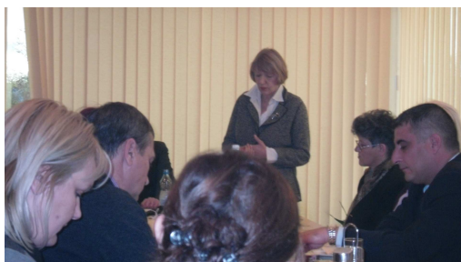
Campaign by HCHRS

Above all, the local elections were significant for the opportunity they offered to Serbs to truly influence the decisions vital to their everyday life. Since the elections were closely connected with decentralization – implying decision-making at the level of local self-governance – the Serb community was given a unique chance to improve its overall position by having its representatives elected in municipal assemblies, mayors included. This was the more so important since decentralization resulted in three new municipalities in Central Kosovo, where Serbs are in majority – Gračanica, Klokot and Ranilug, and since three Serb villages were included in the Novo Brdo municipality.