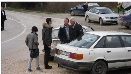
Campaign by HCHRS