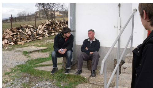
Campaign by HCHRS

For two years now the Helsinki Committee has been in permanent contact with the Serb community in Kosovo 13 and in the position to observe its changes of heart since Kosovo’s independence declaration. Namely, once the Serbs in South decided not to leave their homesteads they started to gradually accept realities in Kosovo (they applied for Kosovo IDs, turned to Kosovo institutions to solve whatever problems they had, etc.). With this in mind, the Helsinki Committee decided to join the campaign for Kosovo Serbs’ participation in the local elections. It publicly appealed to Serbs not to miss the opportunity they were given. One hundred public figures from Serbia put their signature under the Appeal to the Kosovo Serb Community , the first of the sort in many years. The Committee was campaigning in the media and on the terrain some ten days before the election day. It publicized the Appeal in three high-circulation newspapers ( Vecernje Novosti , Kurir and Blic ) that have readership in Kosovo. All the media in Kosovo – Serb and Albanian alike – reported on the press conference it held in Caglavica (Kosovo). TV stations daily hosted people on the team. All in all, both Serb and Albanian community welcomed the campaign.