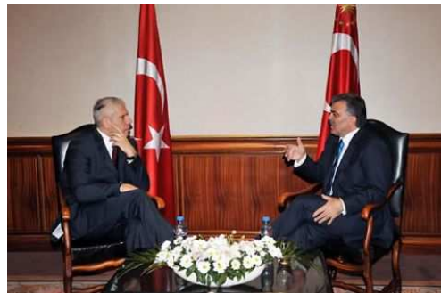
Boris Tadic and Abdullah Gül

Turkey’s more active approach to “Balkan affairs” is a new and major foreign policy factor. In 2009 Turkish President Abdullah Gül and Foreign Minister Davatoglu paid visits to Serbia (Minister Davatoglu visited Sandzak on the same occasion). Intensified tripartite meetings of foreign ministers of Turkey, Serbia and Bosnia-Herzegovina in late 2009 (they met six times in the period September 2009 – February 2010) indicated Ankara’s intention to be more involved in settlement of potential crises in the Balkans – in Bosnia-Herzegovina in the first place, but also in Sandzak – and to contribute to regional stability more than before.