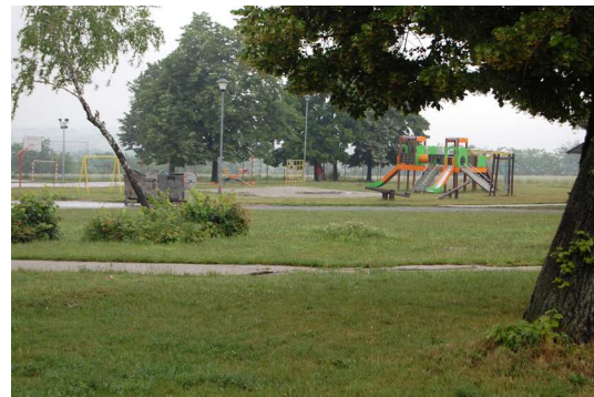
Home for Children and Youth With Mental Disabilities „Veternik“ in Novi Sad