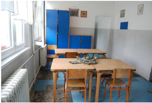
Home for Children and Youth With Mental Disabilities „Sremčica“ in Belgrade