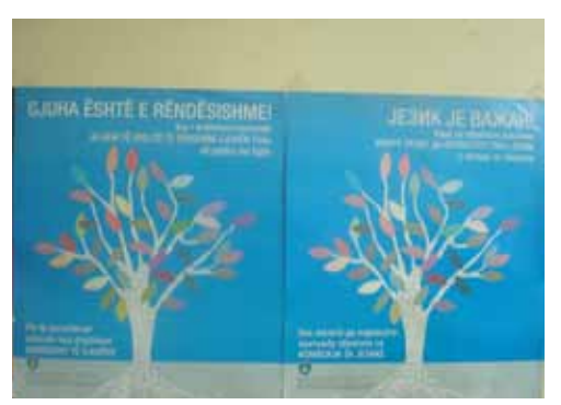
Bilingual poster in the municipality building