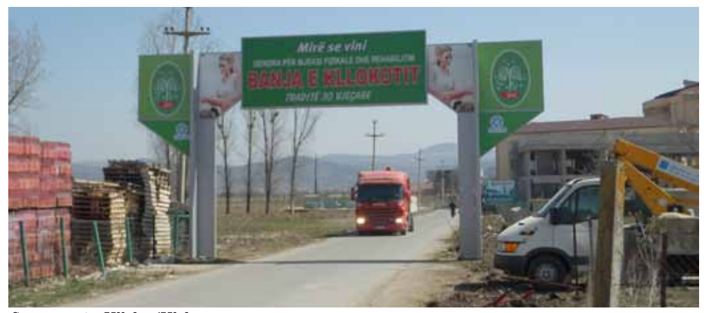
Spa resort in Kllokot/Klokot