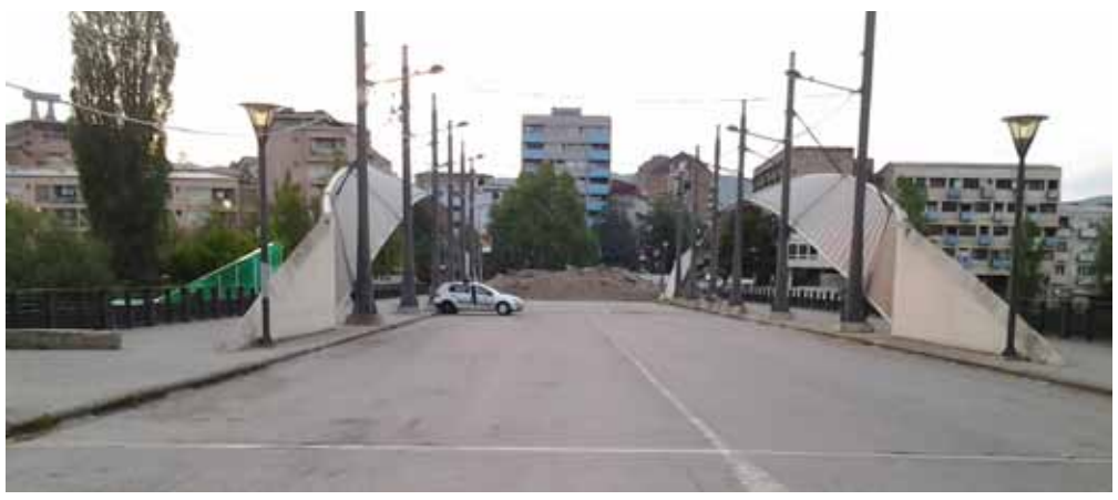
Barricade on the bridge over Ibar river