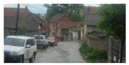
Neighborhood populated by Serbs