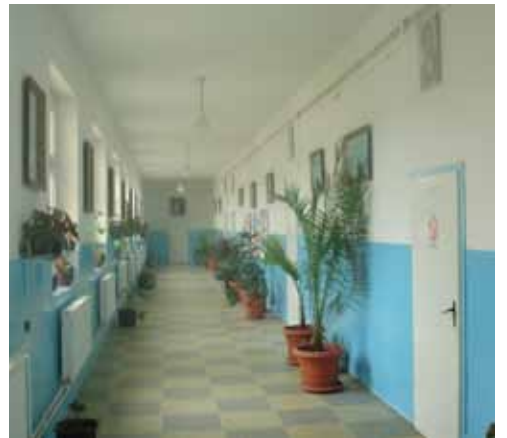
School - inside