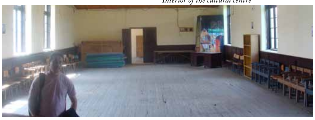
Interior of the cultural centre where youngsters have rehearsals