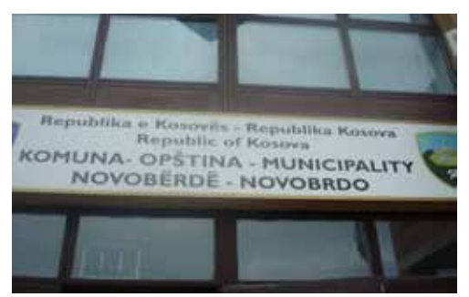
Entrance to the municipality building