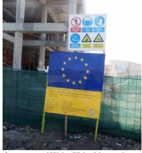
Construction of Kllokot/Klokot Municipality