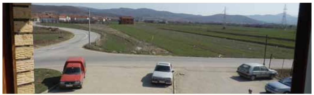
View form the building of Partesh/Partes Municipality