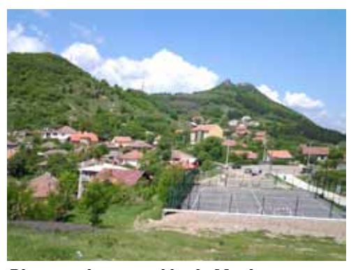
Playground renovated by the North Mitrovica preparation team