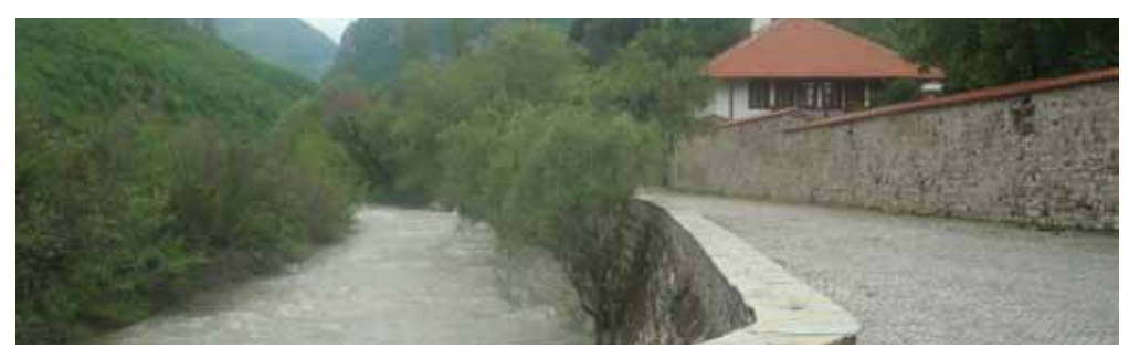
Near the Patriarchate of Peja/Peć