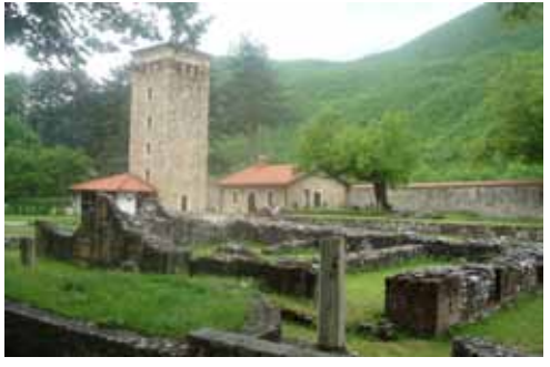
The Patriarchate of Peja/Peć