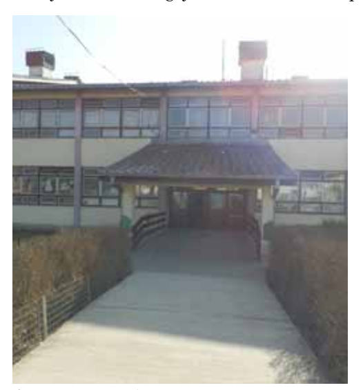
School in Partesh/Parteš