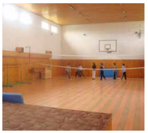
School – gym