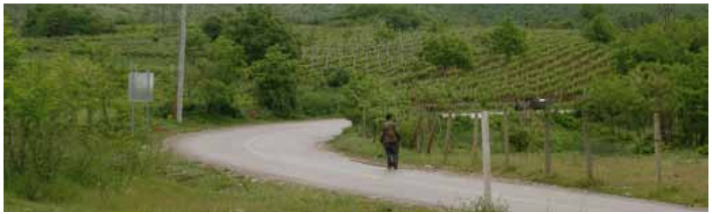
Hoça e Madhe/Velika Hoča wineyards